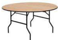
round from .60cm