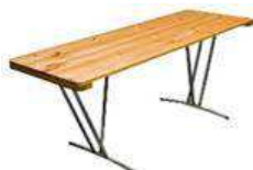
trestles 1.8m 2.1m 2.4m & 3m