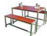
pub bench setting