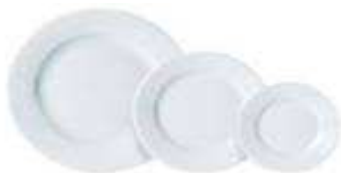
26cm dinner entrée side