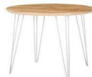
Hi pin leg tables 30cm, 50cm & 90cm Hi