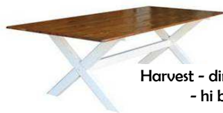
Harvest - dining & - hi bar