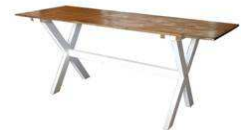
Harvest tall bar