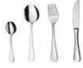
Montreal/ Luxor $6.70/10