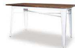
Tolix Hi bar and Café tables