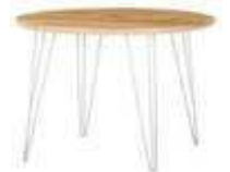
hairpin leg tables