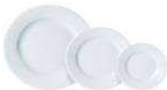
26cm dinner entrée side