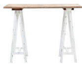
southcape hi bar