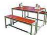
pub bench setting