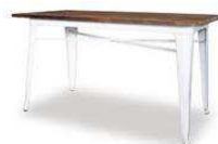
tolix hi bar 1.5m & 1.2m