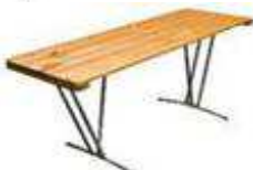
wood trestles - 1.8m, 2.1m, 2.4m, 3m