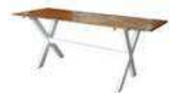
Harvest tall bar