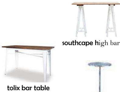
southcape high bar