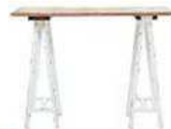
south cape hi bar