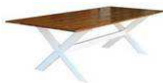
Harvest dining table