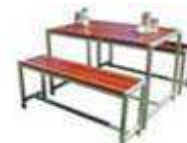
pub bench setting